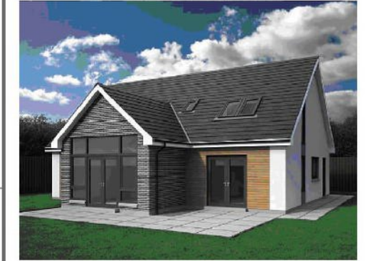
Indicative South East Elevation

Scottish Borders Council Town And Country Planning (Scotland) Act 1997