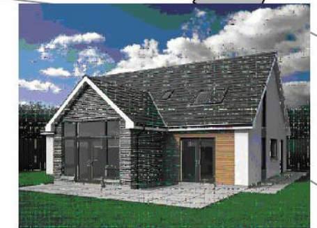
INDICATIVE HOUSE TYPE